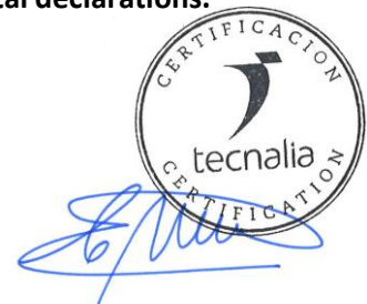
Carlos Nazabal Alsua Manager

Issued date / Fecha de emisión: 23/03/2022 Update date / Fecha de actualización: 23/03/2022 Valid until / Válido hasta: 20/03/2027 Serial Nº / Nº Serie: EPD0650200-E